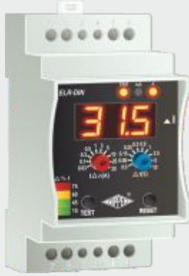
ELR - DIN 35mm